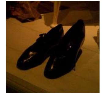
▲Lagerlöf's shoes in Mårbacka